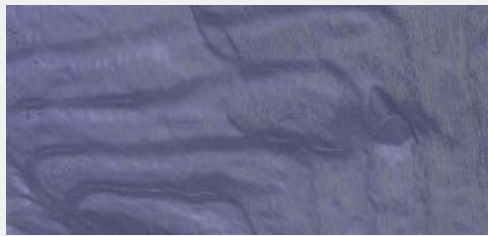
Detail from the model of the K11 kerbstone, showing decorative carving on the rock surface.

The archaeological complex at Knowth, located in the Brú na Bóinne World Heritage Site, consists of a central mound surrounded by 18 smaller, satellite mounds. These monuments incorporate a large collection of megalithic art, primarily in the form of decorated stones lining the mounds' internal passages and surrounding their external bases. The megalithic art found at this site constitutes an important collection, as the Knowth site contains a third of the of megalithic art in all Western Europe. The kerbstones surrounding the main mound at Knowth, while protected in winter, sit in the open air for part of the year, and are consequently exposed to weather and subject to erosion. The Researchers at CAST, in collaboration with UCD Archaeologists and Meath County Council, documented the 127 kerbstones surrounding the central mound at Knowth over the course of two days using close range convergent photogrammetry. This pilot project aims to demonstrate the validity of