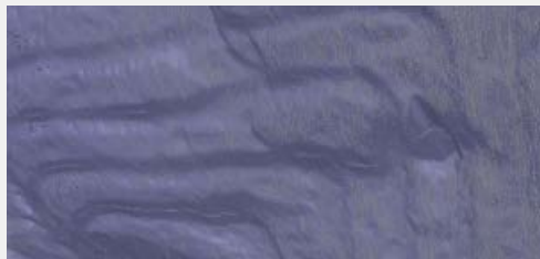
Detail from the model of the K11 kerbstone, showing decorative carving on the rock surface.

The archaeological complex at Knowth, located in the Brú na Bóinne World Heritage Site, consists of a central mound surrounded by 18 smaller, satellite mounds. These monuments incorporate a large collection of megalithic art, primarily in the form of decorated stones lining the mounds' internal passages and surrounding their external bases. The megalithic art found at this site constitutes an important collection, as the Knowth site contains a third of the of megalithic art in all Western Europe. The kerbstones surrounding the main mound at Knowth, while protected in winter, sit in the open air for part of the year, and are consequently exposed to weather and subject to erosion. The Researchers at CAST, in collaboration with UCD Archaeologists and Meath County Council, documented the 127 kerbstones surrounding the central mound at Knowth over the course of two days using close range convergent photogrammetry. This pilot project aims to demonstrate the validity of