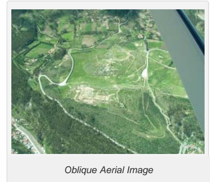
Oblique Aerial Image

Download these images here and follow the workflows for photogrammetric processing in PhotoScan or PhotoScan Pro .