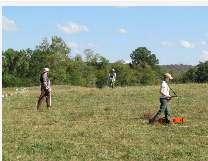
The Geonics EM38-MK2 Conductivity Meter and the Bartington Grad601-2 Magnetic Gradiometer.

Our research has recently focused on improving field methodologies, data processing, and interpretation to make geophysics more accessible to archaeologists. We are also researching how subsurface instruments can aid in modern construction processes on the University of Arkansas campus. The Center has three geophysical instruments, details of which can be found at Hardware . CAST also has an extensive suite of processing software, details can be found at Software .