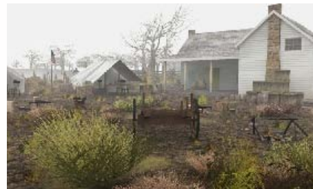
Historic Visualization of Prairie Grove Battlefield