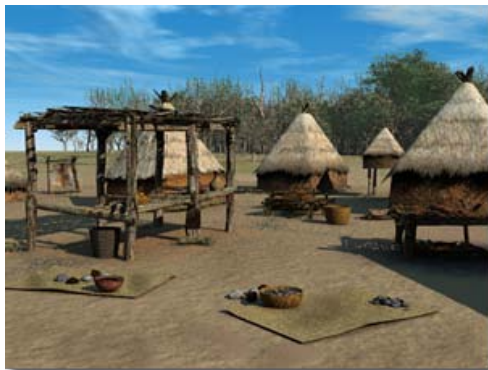
Upper Nodena Village Visualization

Modeling Projects Available: Data sets are provided here for public use. Use of these data sets, under the creative commons license, is intended to introduce the concepts of 3D modeling and visualization allowing visitors to become familiar with the programs. CAST has projects all over the world. See the individual data sets for more information about our projects.