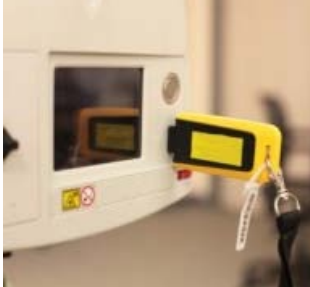
Leica C10: Exporting Your Scan Data