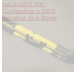
Leica GS15: Tripod Setup