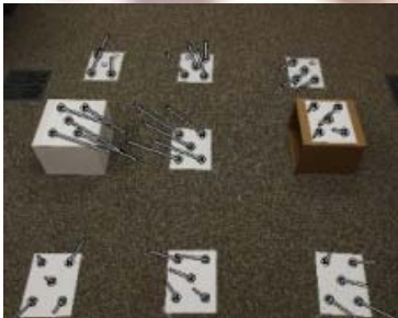
Camera Calibration Documentation for Close-Range Photogrammetry