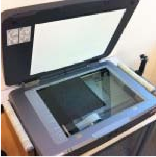
Figure 2: Transparent Film on Scan Bed

7. Placement – Carefully place the media face down in the upper left corner of the scan bed (Figure 2). We recommend using clean gloves when handling transparent film or print media.