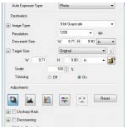
Figure 1: Settings for scanning with EPSON Scan software