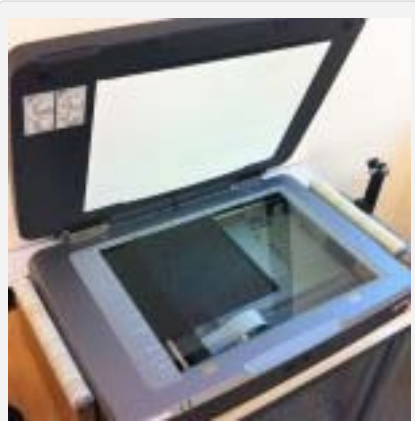
Figure 2: Transparent Film on Scan Bed

7. Placement – Carefully place the media face down in the upper left corner of the scan bed (Figure 2). We recommend using clean gloves when handling transparent film or print media.