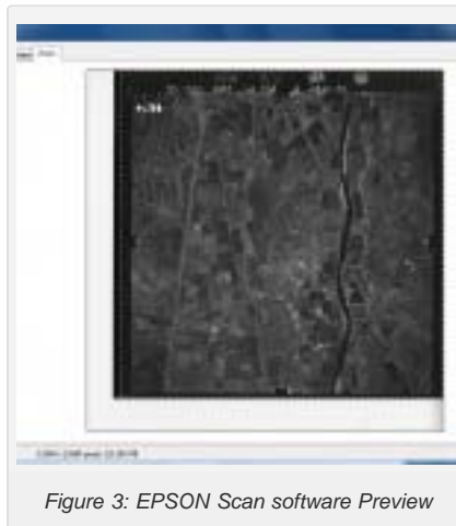
Figure 3: EPSON Scan software Preview

8. Click the “Preview” button at the bottom of the dialog and the scanner will begin scanning.