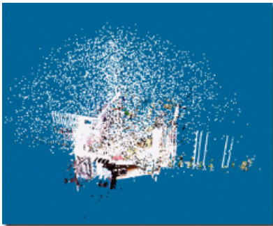
Figure 4: Extraneous data in the scan that will need to be filtered out

1. Once all of the scans have been color mapped, go through and verify the quality on all of them. As you are viewing the data in the viewing window that there are extra scan points floating around in the air, as shown in the figure below. The data needs to be filtered before it is exported from Laser Control.