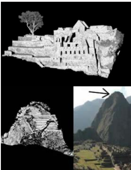
Machu Picchu, Peru - Huayna Picchu